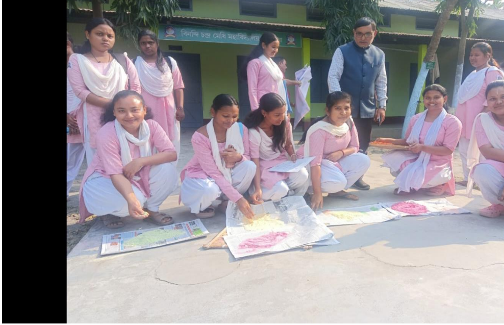
Nampara Ramdia, Milpara-Ramdia Rd, Bamundi Ganak Para, Assam 781102, India 02 Mar 2026 02:31 pm