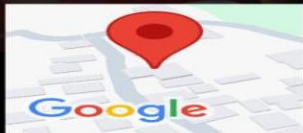
6FGW+24G, Majorkuri, No.2 Dokania, Assam 781102, India 02 Mar 2026 11:14 am