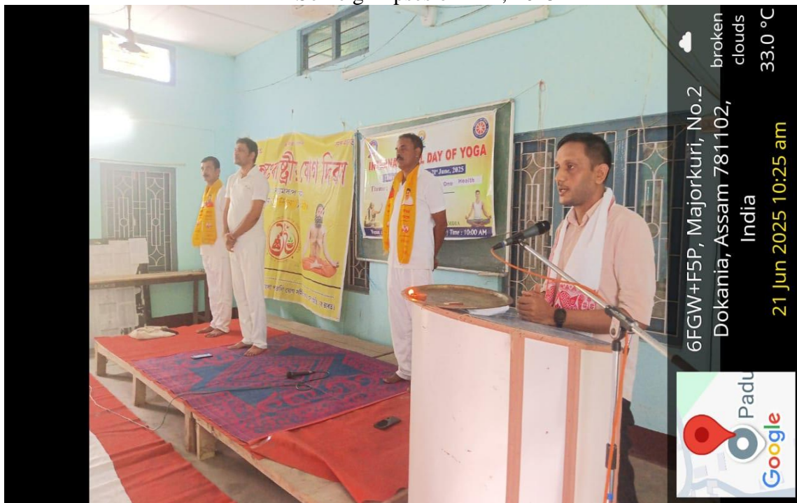
Some glimpses of IDY, 2025