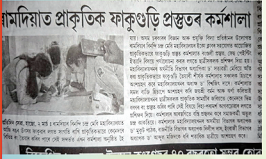
বামদিয়াত প্রাকৃতিক ফাঙ্কগুড়ি প্রস্তুত কৰ্মশালা