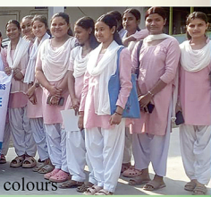
Students Prepared Ecofriendly holi colours