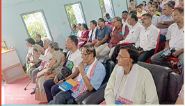
College Foundation day