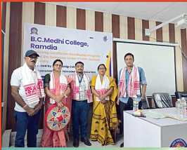
ternship Certificate Distribution