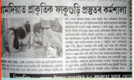
বামদিয়াত প্ৰাকৃতিক ফাৰ্গুণ্ডি প্ৰদৰ্ভত কৰ্মশালা