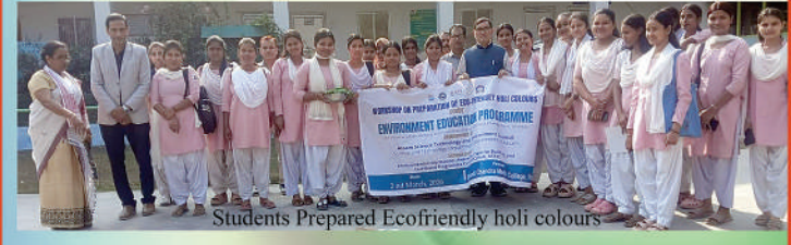
Students Prepared Ecofriendly holi colours