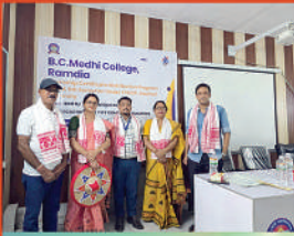
ternship Certificate Distribution